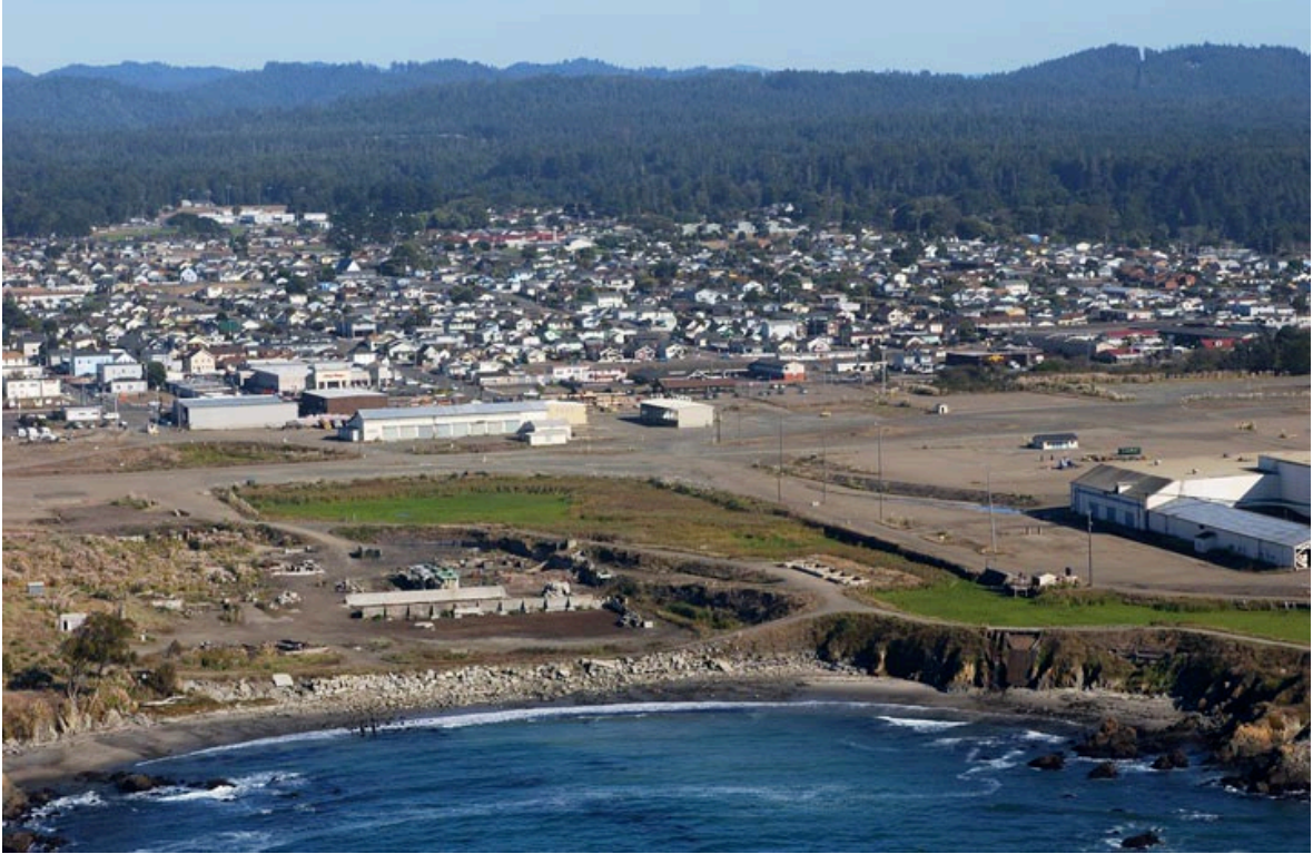
California Coastal Records Project, 2005