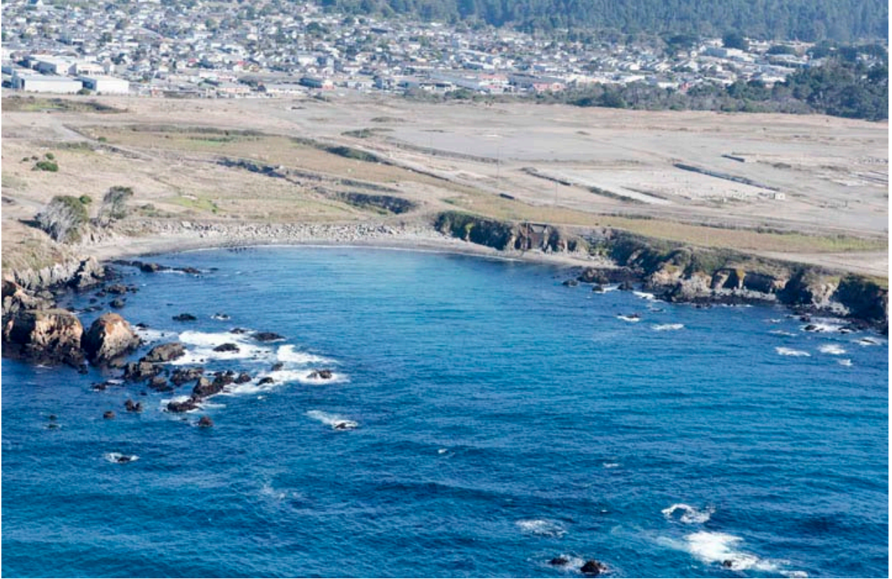
California Coastal Records Project, 2019