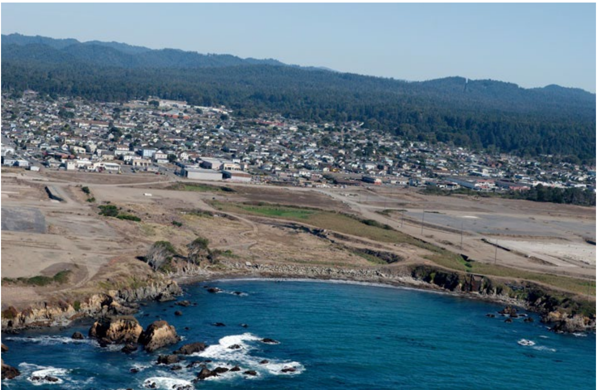
California Coastal Records Project, 2013