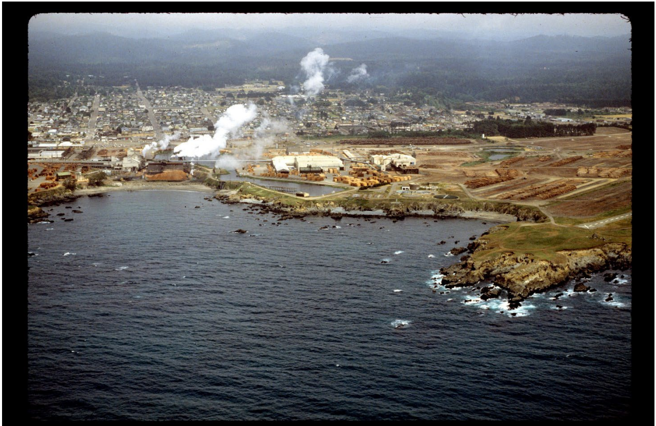
California Coastal Records Project, 1987